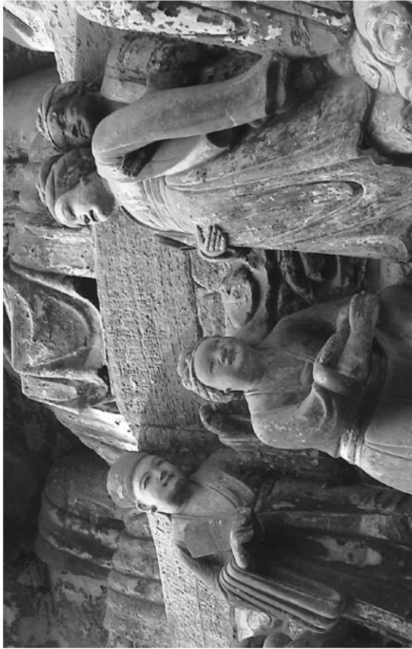
Figure 4. Sculpture Depicting Childbirth Scene Sculpture depicting scenes from the Buddhist scripture Foshuo fumu enzhong nambaojing 佛說父母恩重難報經; located in Dazu, Sichuan.